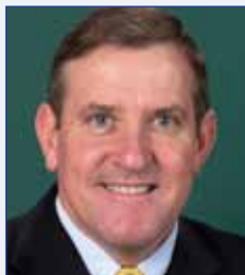
Hon. Ian Macfarlane MP - Shadow Minister for Energy and Resources Australian Liberal Party

The Hon Tom Koutsantonis MP is the Minister for Manufacturing Innovation and Trade, Minister for Mineral Resources and Energy and Minister for Small Business and also is the chair of the State Government's Competitiveness Council. He was elected to the South Australian State Parliament in October 1997, was the presiding member of the Economic and Finance Committee from 2006 – 2009 and appointed to the Ministry in March 2009.