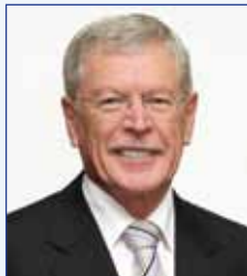
Hon. Norman Moore MLC - Minister for Mines and Petroleum Government of Western Australian

Norman Moore was elected to the Legislative Council in 1977 and was appointed Minister for Mines and Petroleum; Fisheries; and Electoral Affairs on the election of the Liberal-National Government in September 2008.