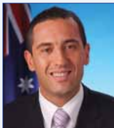
Hon. Tom Koutsantonis MP - Minister for Mineral Resources and Energy South Australian Government

The Minister has also initiated the single biggest overhaul of the mining industry's occupational health and safety system, lifted the previous ban on uranium mining and helped the State move towards increased energy security and improved standards of living.