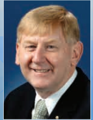
MARTIN FERGUSON AM MP Shadow Minister For Primary Industry, Resources, Forestry & Tourism